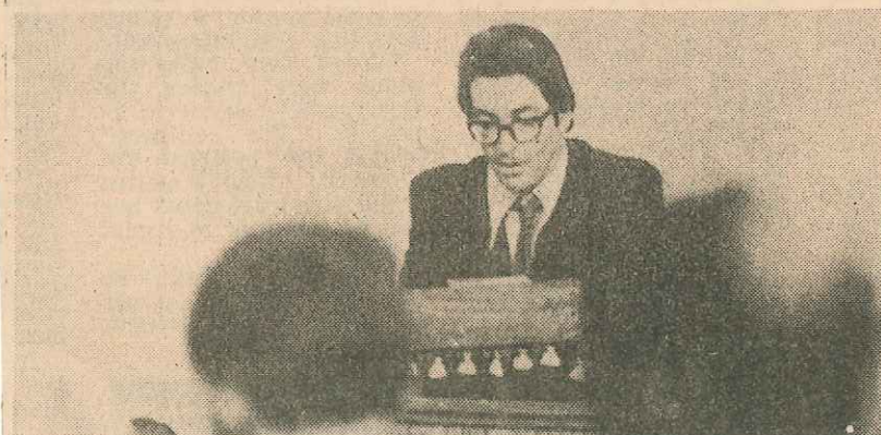
Mr Arthur Chaskalson, reads tributes to Bram Fischer at the cremation ceremony in Bloemfontein yesterday.