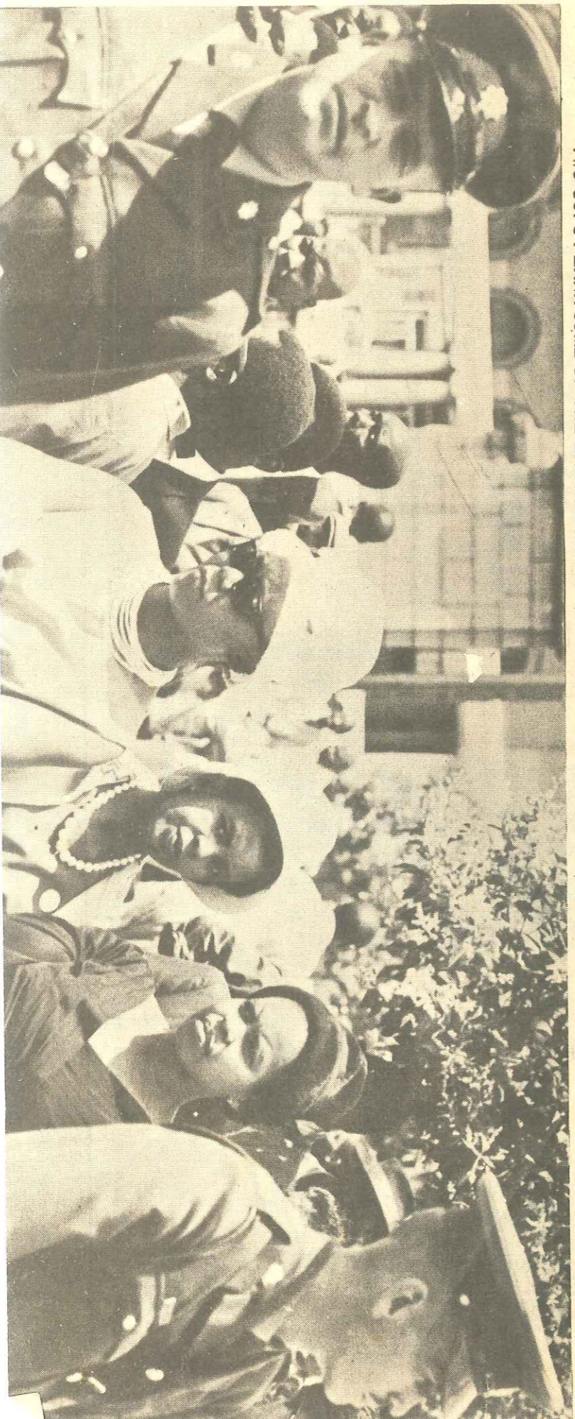
TWO COPS FLANK SOME OF THE LARGE NUMBER OF WOMEN WHO WENT TO HEAR THE OPENING OF THE RIVONIA TRIAL