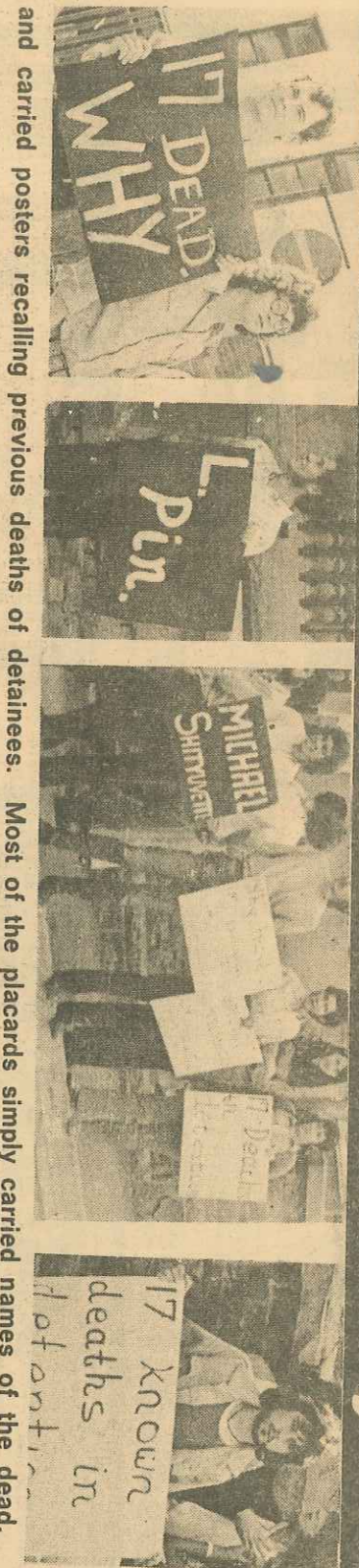
and carried posters recalling previous deaths of detainees. Most of the placards simply carried names of the dead.

...and another limps to a cemetery to bury his